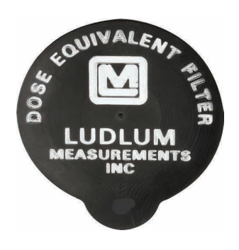
Ambient Dose Filter