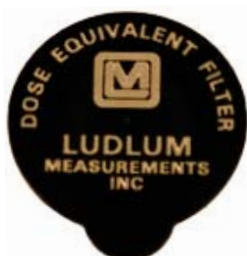
Ambient Dose Filter