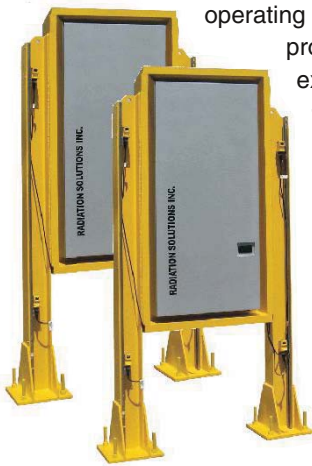
▲ RS-200/6000 2 detector system

The system is fully modular which makes it easily configurable to suit local logistics and permits fast, easy maintenance . The system operates independently and has direct Ethernet connectivity to plant networks. This connectivity allows for a fully integrated plant design with the ability for RSO overview on all installed systems.