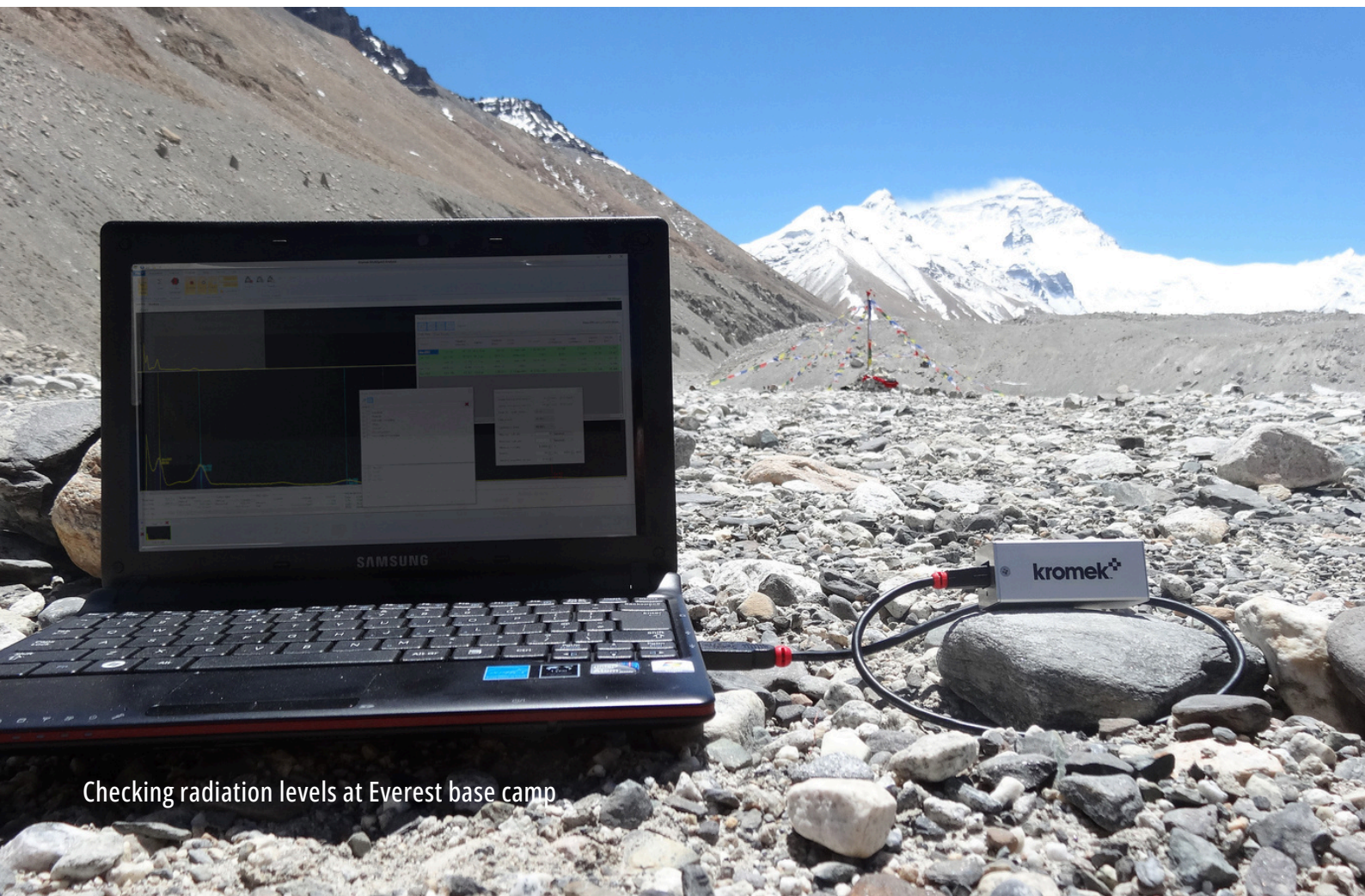
Checking radiation levels at Everest base camp

Gate Input: used to suppress pulse height output via the USB interface to K-Spect for anticoincidence. Energy and timing outputs are unaffected.