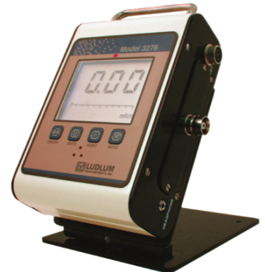
Model 3276 with desktop stand option