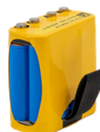
Rechargeable Battery Pack Option