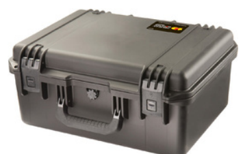
Transport & Storage Case Option