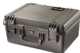
Transport & Storage Case Option