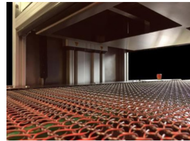
Detector height adjustment